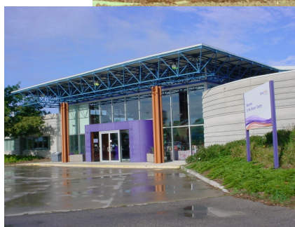
Bruce Power Visitors Centre